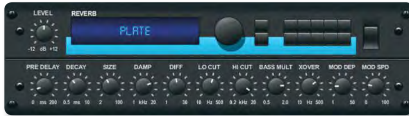
PLATE REVERB emulates the characteristics of a plate reverb chamber with control over the damping pad, modulation depth and speed, and crossover. This classic effect will give your tracks the sound heard on countless hit records since the late 1950's. (Inspired by Lexicon PCM70*)

12-Input Digital Mixer for iPad/Android Tablets with 4 Programmable MIDAS Preamps, 8 Line Inputs, Integrated Wifi Module and USB Stereo Recorder