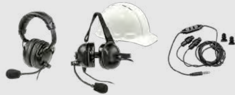
LA-454 / LA-455 / LA-456 *NRR rated