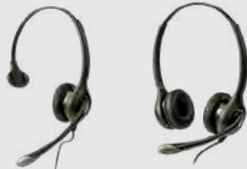
LA-452 / LA-453