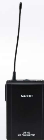
U T - 6 2 Bodypack