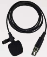
L A V - 6 Tie-clip Microphone