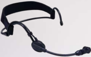
H M - 7 Headset Microphone

With Hesdset Microphone / Tie-Clip Microphone