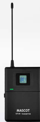
U T - 6 1 Bodypack Transmitter