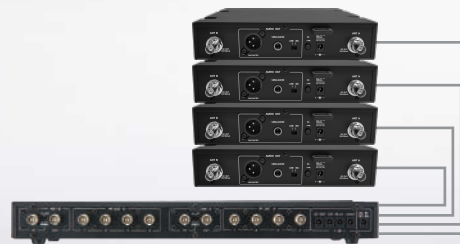
Antenna Divider AD-242

◀ Detachable receiver antennas for using of professional antenna systems.