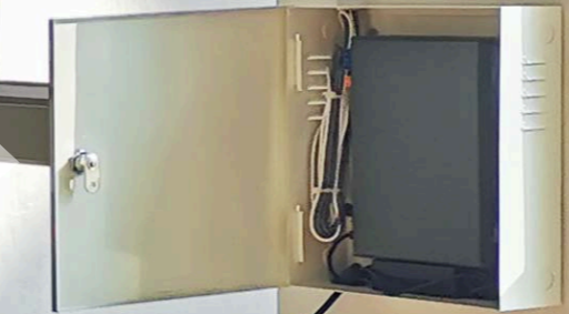
Infrared Receiver Amplifier IRA-300