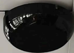
Infrared Sensor IRS-55